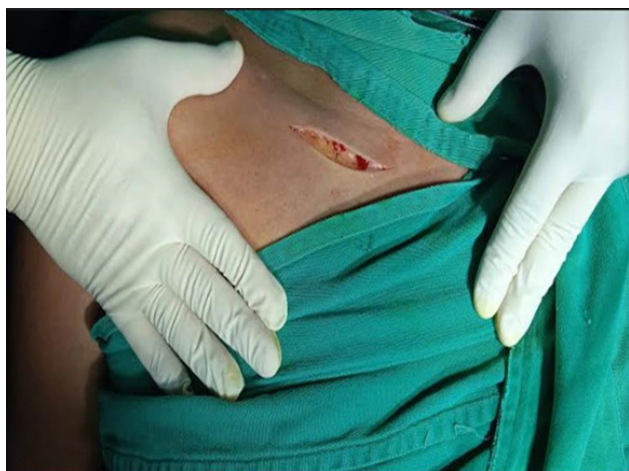
Figure 2. Longitudinal incision from the medial edge of the sternum to the middle third of it, approximately 10 centimeters.