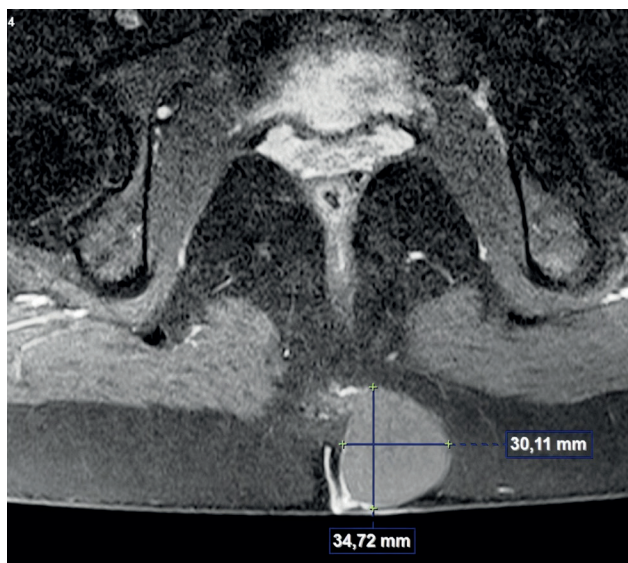
Figure 1. Computed tomography image of epidermal cyst